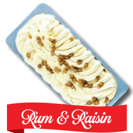
Rum & Raisin