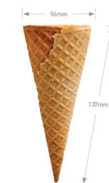
Flat Top B 56mm x 137mm