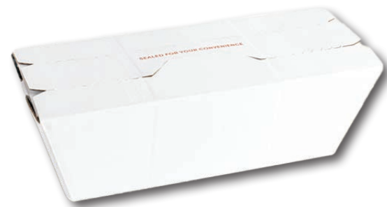
Take Home Tub 1000ml