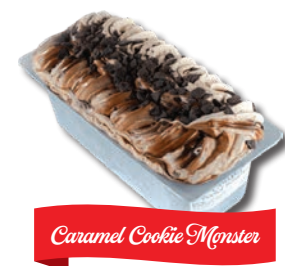
Caramel Cookie Monster