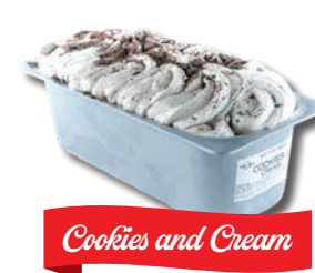
Cookies and Cream