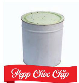
Pepp Choc Chip