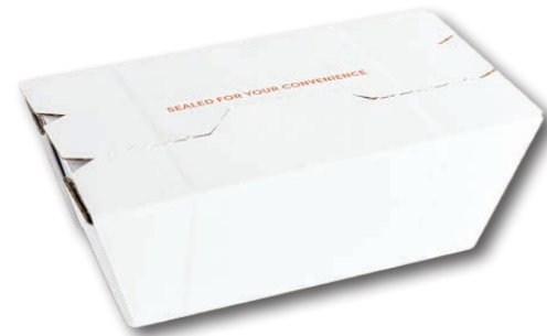
Take Home Tub 500ml