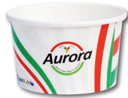
Aurora Cup 5oz