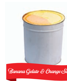
Banana Gelato & Orange Sorbet