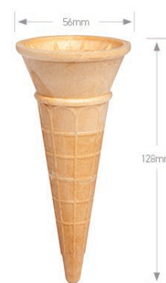
Single 208 (208 in a box) 56mm x 128mm