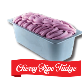
Cherry Ripe Fudge