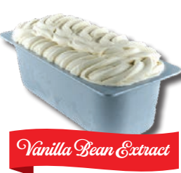
Vanilla Bean Extract