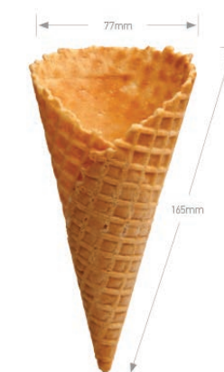
Waffle D 77mm x 165mm