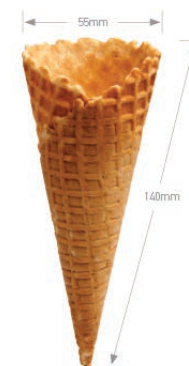
Waffle B 55mm x 140mm