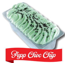
Pepp Choc Chip