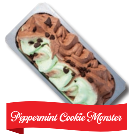
Peppermint Cookie Monster