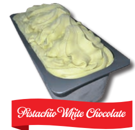
Pistachio White Chocolate