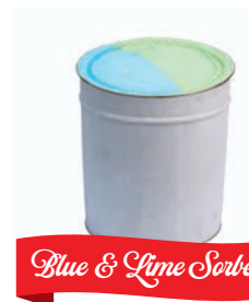
Blue & Lime Sorbet