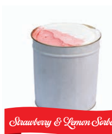
Strawberry & Lemon Sorbet