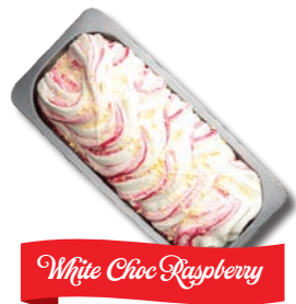
White Choc Raspberry