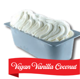
Vegan Vanilla Coconut