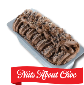
Nuts About Choc