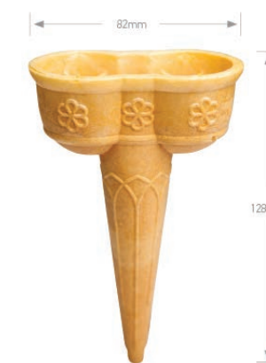
Double 200 (200 in a box) 82mm x 128mm