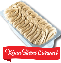
Vegan Burnt Caramel