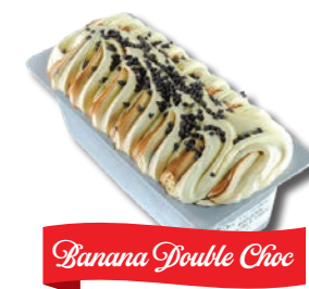
Banana Double Choc