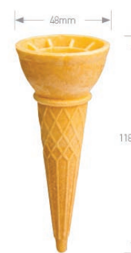
Kidzone 48mm x 118mm