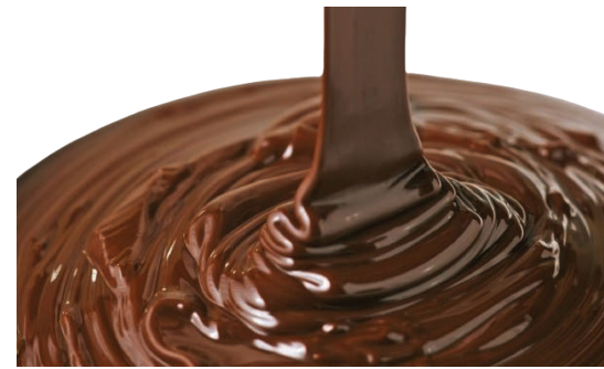
Milk Chocolate Dip