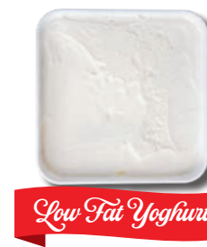
Low Fat Yoghurt