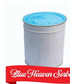
Blue Heaven Sorbet