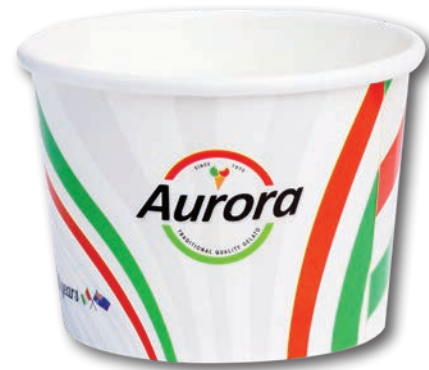
Aurora Cup 3oz