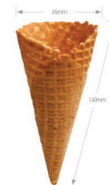
Waffle C 65mm x 140mm